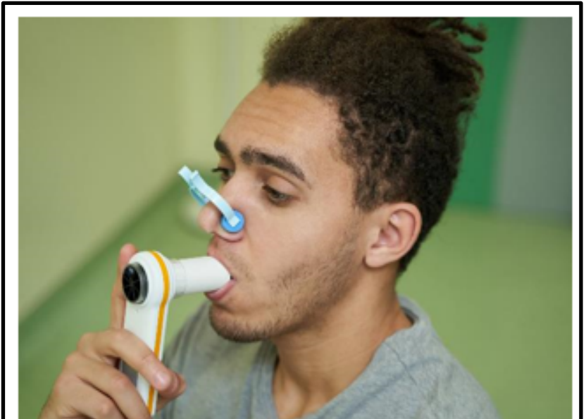
Photo 1. Breathing into a lung function machine. Lung function tests are done at the screening visit and during induced sputum

Having signed the appropriate forms, the investigator will go through a few questions for administrative purposes and detailed questions related to your health. This will be followed by a brief medical examination of your skin including looking for evidence of a previous BCG scar, heart, lungs, abdomen and glands. We will record your weight and height. To check that your lungs are healthy, we will measure your lung function. The lung function test is done by taking a deep breath and then breathing out through a mouthpiece attached to a machine which gives us readings. (see Photo 1)