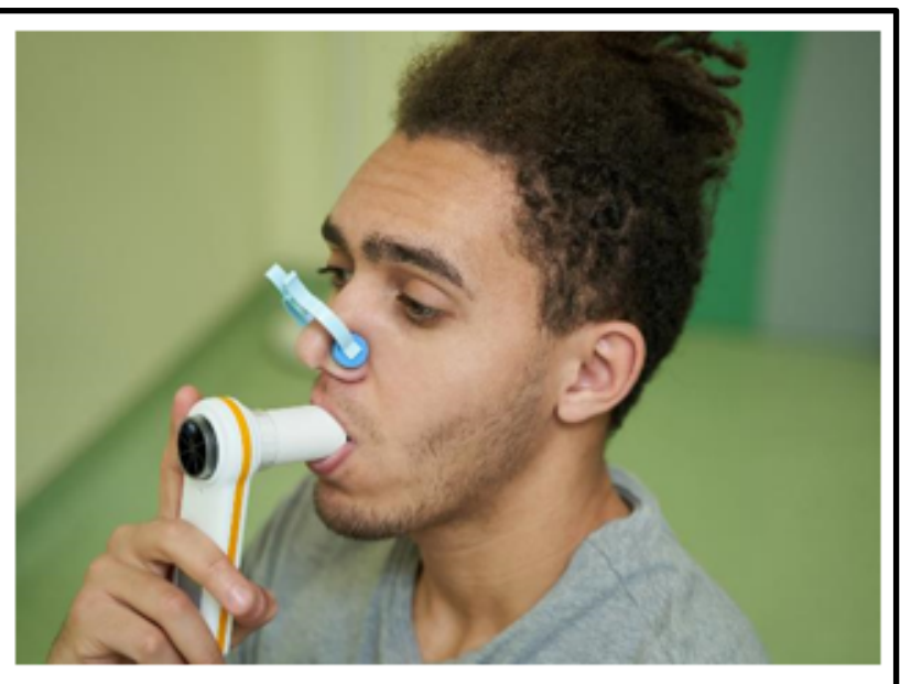
Photo 1. Breathing into a lung function machine. Lung function tests are done at the screening visit and during induced sputum

If you are eligible, we will let you know that you are eligible and you may either have your blood and sputum samples taken immediately or asked when would be a convenient time to return for testing.