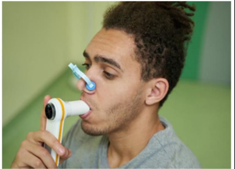
Photo 1. Breathing into a lung function machine. Lung function tests are done at the screening visit and during induced sputum

If you are eligible, we will let you know that you are eligible and you may either have your blood and sputum samples taken immediately or asked when would be a convenient time to return for testing.